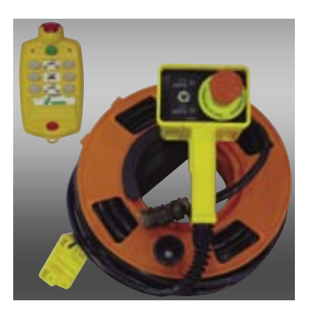
Remote control (cable or optional radio remote) frees the operator to monitor the end hose and the pump. Critical functions including on/off and forward/reverse are at your fingertips.

Because your SP model is patterned on larger Schwing models, you are guaranteed legendary reliability that has been proven on thousands of projects. Whether your pump is your livelihood or part of a larger equipment fleet, purchase with the confidence that only a Schwing can provide.