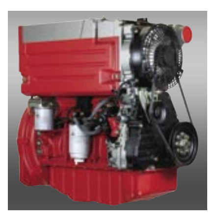
Fuel efficient Deutz diesel is an example of the high quality components on our trailer pumps. Here is an engine that was designed for construction applications and is up to the reliability standards of a Schwing pump.