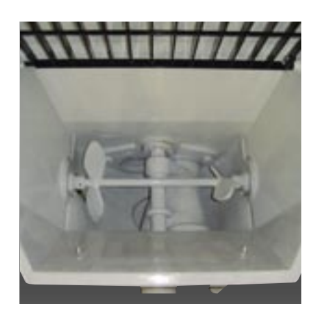
Fast cleanout with less wasted concrete is a benefit of the SP 500 over other pumps. The standard hopper agitator keeps harsher mixes flowing to the Rock Valve<sup>TM</sup> for trouble-free pumping.