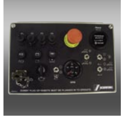
Convenient control panel includes electric switches for on/off, forward/reverse and agitator on/off. Tachometer and hour meter are also located here along with E-stop, fuse panel and ignition switch.