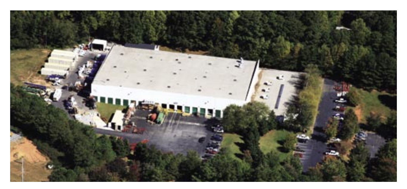
The stationary pump plant in Atlanta is a modern model of efficiency, manufacturing pumps in trailer, skid or truck-mounted configurations for applications around the world. From close inspection of incoming materials to forming our products with the latest production processes, Schwing takes craftsmanship to the highest standards. Vigorous testing of every unit prior to shipment is your assurance of reliable pumping. In addition, a vast inventory of parts are on hand to keep your Schwing product running at maximum efficiency. Please schedule a visit to this modern facility located just north of Atlanta to see our long-term commitment to the global market.

Generations of successful owners have chosen the Schwing experience. As a third generation family owned company we understand how important quality equipment is to your business and how important your business is to us.